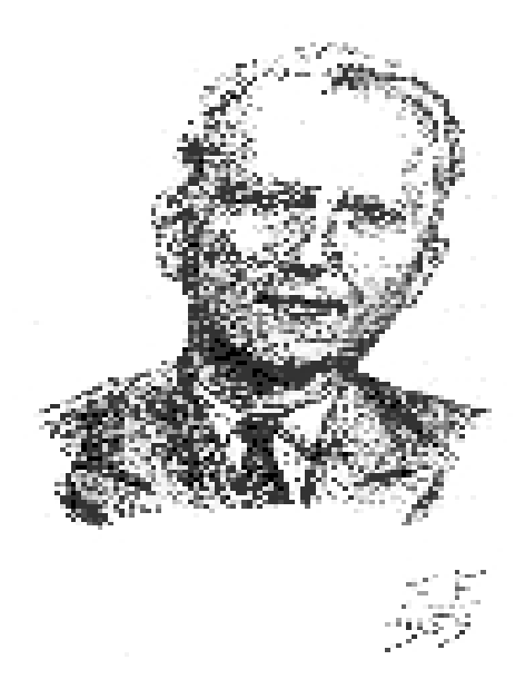
Figure 3: Eugène Ehrhart

work in a monograph [41] of 1974.<sup>21</sup> Ehrhart's trailblazing work was not completely accurate. A rigorous treatment was first given by Macdonald [95] in 1971. Ehrhart theory is now a central area of EAC with many applications and connections to other subjects.