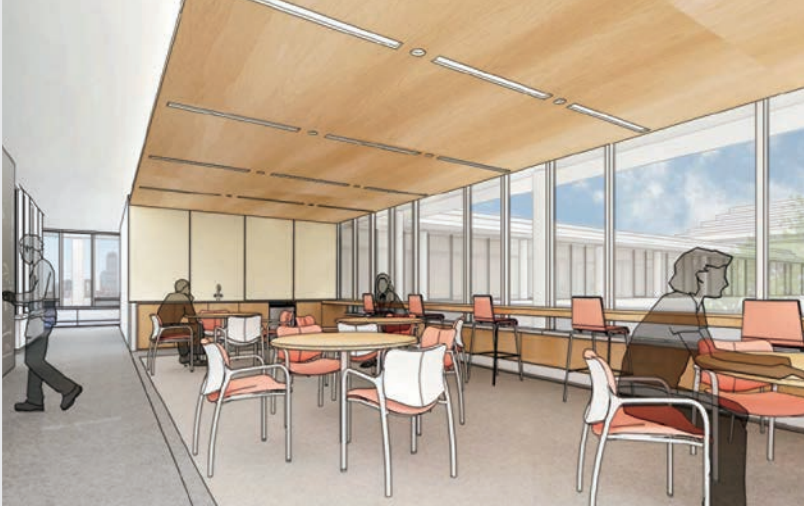
Graduate student tower