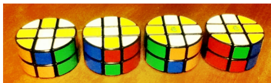
Figure 3. Standard puzzle after applying blurdb rBrdf lblfrBrBrBdrbub .

to the standard puzzle. Below are four views of a standard puzzle after applying this move sequence. The leftmost has the same orientation as the standard configuration.