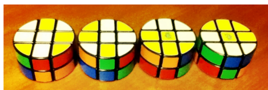
Figure 2. Views of a solved puzzle in the standard configuration after applying frBul .

Below are four views of a puzzle that had the move sequence frBul applied to a solved puzzle in the standard configuration. The view on the far left has the same orientation as the standard configuration. You may wish to verify this with your puzzle.