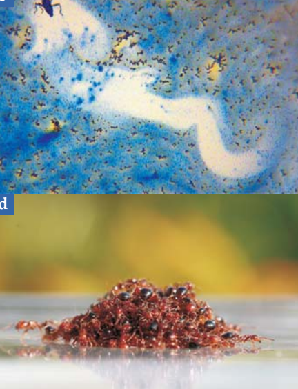
Figure 1. Microphysics enables water walking. (a) Surface tension serves as a trampoline that supports the weight of small water walkers, such as this fisher spider. Note the beaded drops on the spider's water-repellent coat. (b) By releasing a lipid, this Microvelia generates a surface-tension difference that propels it forward. (c) Some insects, like this Hydrometra, can climb a meniscus by clasping it with the hydrophilic claws on its front and hind legs. (d) During times of flood, fire ants assemble into a floating, water-repellent raft.