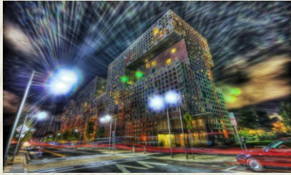
MIT Simmons Hall.

Program for Research In Mathematics, Engineering, and Science for High School Students